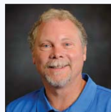
Paul Brown Event Management